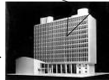
Ministry of Health